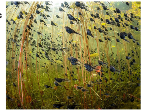
WILDLIFE PHOTOGRAPHER OF THE YEAR