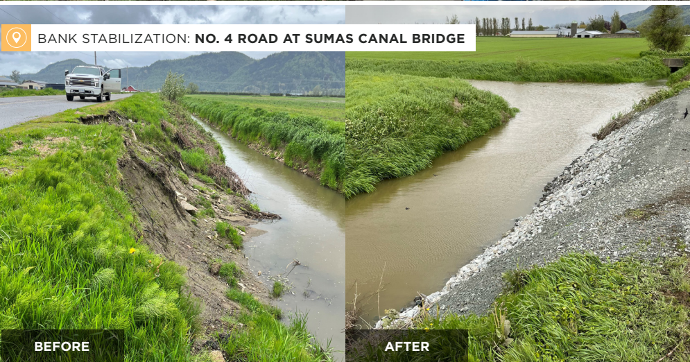
BANK STABILIZATION: NO. 4 ROAD AT SUMAS CANAL BRIDGE