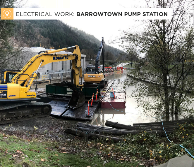
ELECTRICAL WORK: BARROWTOWN PUMP STATION