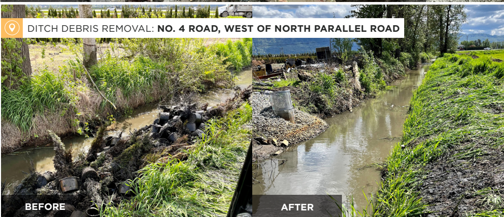
DITCH DEBRIS REMOVAL: NO. 4 ROAD, WEST OF NORTH PARALLEL ROAD