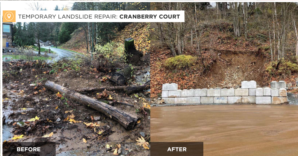
TEMPORARY LANDSLIDE REPAIR: CRANBERRY COURT