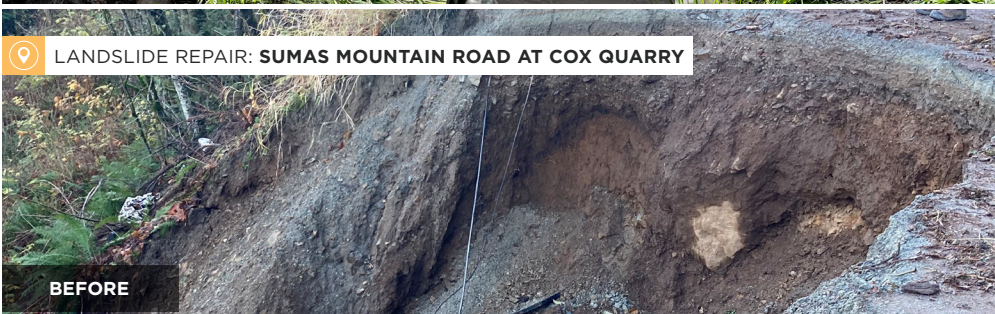
LANDSLIDE REPAIR: SUMAS MOUNTAIN ROAD AT COX QUARRY