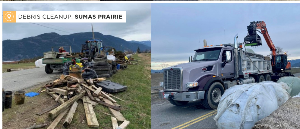
DEBRIS CLEANUP: SUMAS PRAIRIE