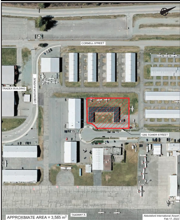
APPROXIMATE AREA = 3,585 m 2