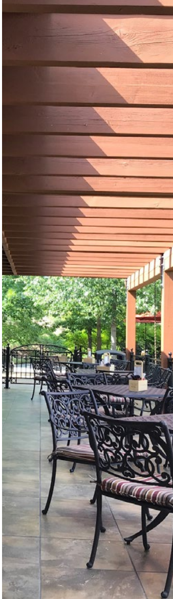
*Ancillary activities are only permitted with applicable Provincial licensing