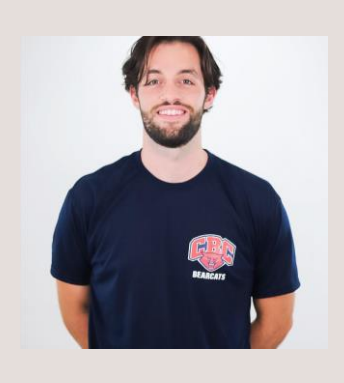
Aaron Adrian Cyrus Centre