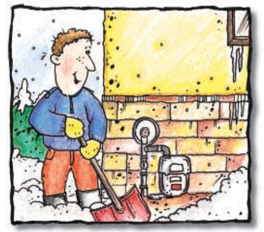
Keep meter clear!