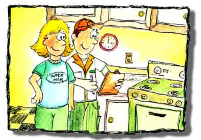
Have regular inspections and maintenance