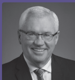
MAYOR HENRY BRAUN